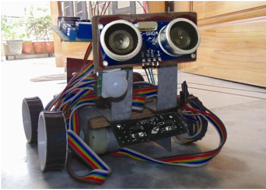
Fig 3: Prototype of the proposed system

To make the prototype of the proposed system, sensors had been assembled as mentioned. Two DC motors were connected with wheels, and one castor wheel was connected to help the ROBOT in navigation. 9V battery was connected as power source. Then many obstacles were placed in the path and the ROBOT detected those obstacles successfully and the Ultrasonic Sensor was able to detect its path every time. At the second part when a human was within the range of 4 ft. of the PIR Sensor, it stopped the ROBOT and started generating output and turning the RF transmitter ON. On the other hand, the RF receiver received the transmitted signal showing an output to the LCD as ‘Human Detected’.